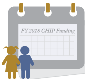
Figure 1. Fiscal Year 2018 CHIP Funding Uncertainty

Various bills have been introduced in Congress to make CHIP funding permanent. The Patient Protection and Affordable Care Enhancement Act, which was passed by the House of Representatives in July of 2020, included permanent funding for CHIP. Earlier this year, the CARING for Kids Act (H.R. 66) and the CHIPP Act (H.R. 1791) were introduced in the House—both bills would permanently fund CHIP and extend other CHIP financing structures such as the Child Enrollment Contingency Fund. 14